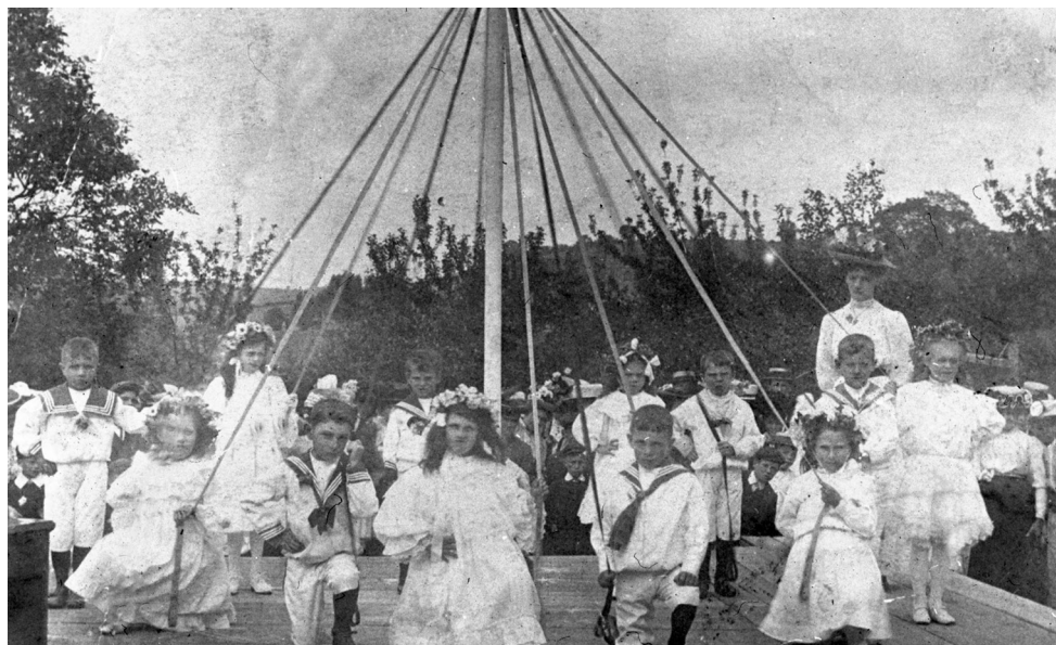
The pupils of St. Julian's School dancing round the Maypole, ca. 1900